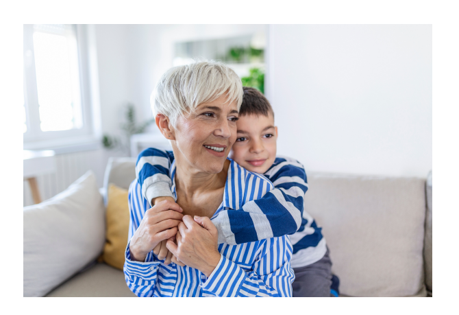
<u>Kinship Family Support Services</u> -Lutheran Social Service of Minnesota (LSS)

LSS Kinship Family Support Services provides education, information and compassionate support for families