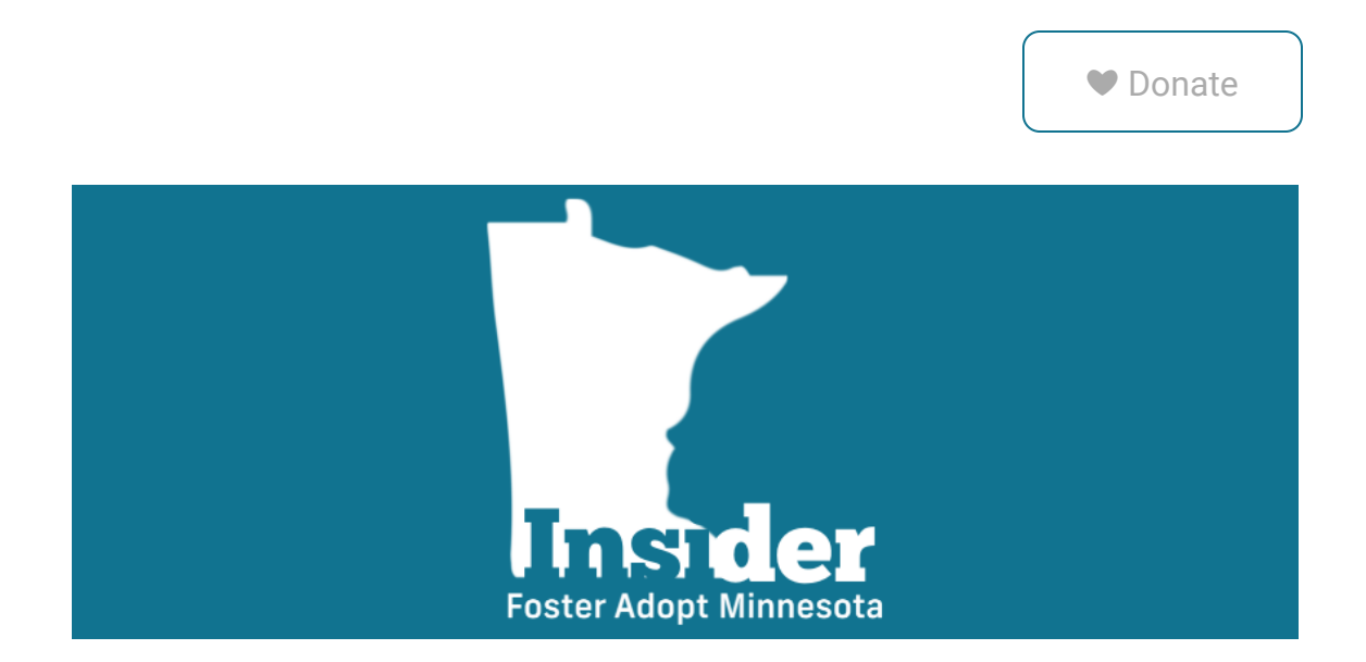
Keep reading to stay informed on events and happenings at Foster Adopt MN, as well as information about our programming and ways you can help with our mission of finding and strengthening Minnesota adoptive, foster care, and kinship families.