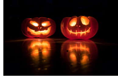
Halloween at Home